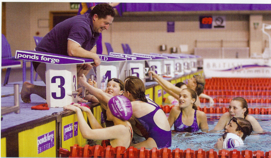
NLP teaches coaches how to maintain consistent behaviour, be a strong leader and stay calm under pressure